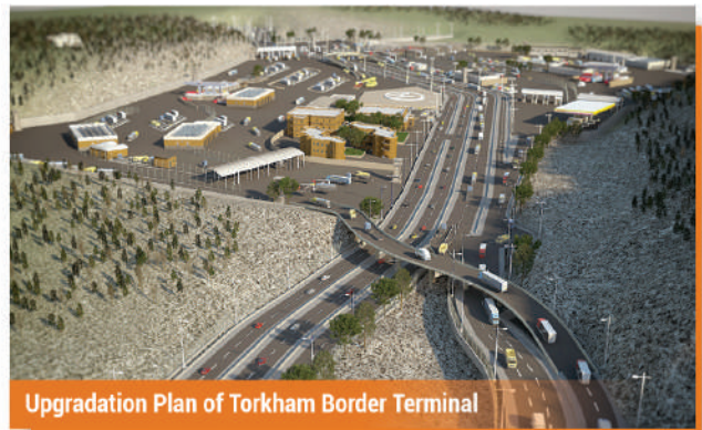
Upgradation Plan of Torkham Border Terminal